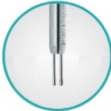
SS 316Ti / Hastelloy C276 without Safety Head