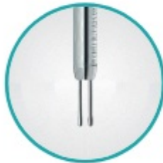
SS 316Ti / Hastelloy C276 without Safety Head