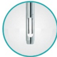
SS 316Ti with Safety Head