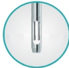
SS 316Ti with Safety Head