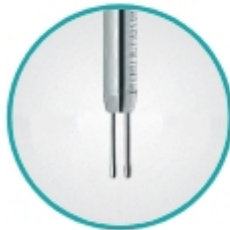
SS 316Ti / Hastelloy C276 without Safety Head